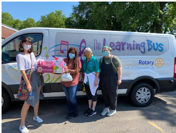
The Rotary Learning Bus in use during COVID-19.